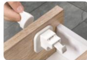
Invisible Cupboard Lock

Carefully designed, top quality products for protecting against falls, finger-traps, electric shocks, burns and access to dangerous objects are what Fred is all about.