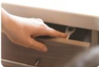
Top Drawer Catch